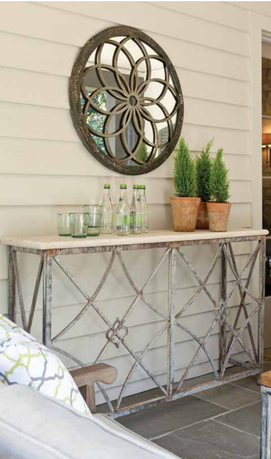
Comfortable outdoor furniture invites guests to sit and relax on the back porch. And with the handy iron and stone table serving drinks and food is easy. The stone fireplace and TV make this porch an almost year-round entertaining center for the cottage.

The original back porch was falling in when the house was purchased, but together David and Lauren created an outdoor haven with the addition of a stone fireplace and comfortable seating. The crumbling wooden floor was replaced with durable bluestone, and during football season this is where the entertaining happens.